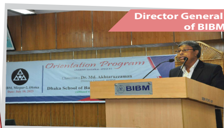
Director General of BIBM