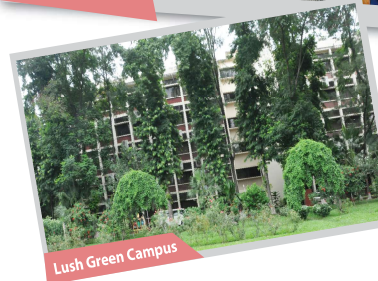
Lush Green Campus